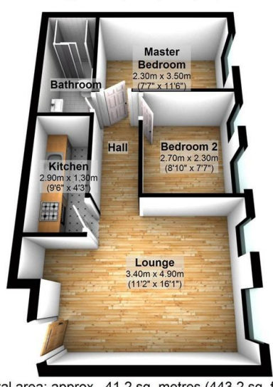
Total area: approx. 41.2 sq. metres (443.2 sq. feet)

This floor plan is for illustrative purposes only and is not to scale. Where measurements are shown, these are approximate and should not be relied upon. Total square area includes the entirety of the property and any outbuildings/garages. Sanitary ware and kitchen fittings are representative only and approximate to actual position, shape and style. No liability is accepted in respect of any consequential loss arising from the use of this plan. Reproduced under licence from Evolve Partnership Limited. All rights reserved. Plan produced using PlanUp.