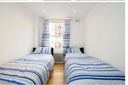
Guide Price £550,000